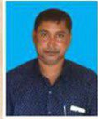
Saidul Islam Institute Head